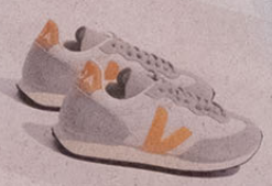
↑ Rio Branco Gravel Ours Alveomesh