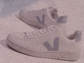
↑ V-12 Extra-White Steel, leather

VIAX Darwin 87 quai des Quoyes 33100 Bordeaux, France