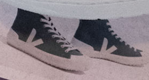
Nova High Peler Pierre, organic cotton